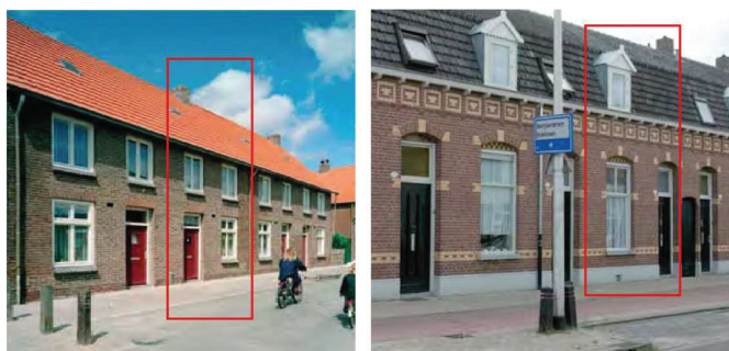
Figure 1. Typical terraced house built before 1945. The outline illustrates the intermediate position of the dwelling between adjacent terraced houses. Source[17]

The terraced houses (rijwoningen in Dutch) represent 42% of the total residential stock in the Netherlands [17]. Even though renovated from their original condition, these pre-war dwellings (Figure 1) have an energy label of G [17], representing the high heating demands of this dwelling type. Therefore, such dwellings would require renovations before using lower temperature heating. This study used a case example of an intermediate terraced house constructed in 1938. The selected case is also a part of an ongoing "LT Ready" project within the faculty of Architecture and the Built Environment at TU Delft [18].