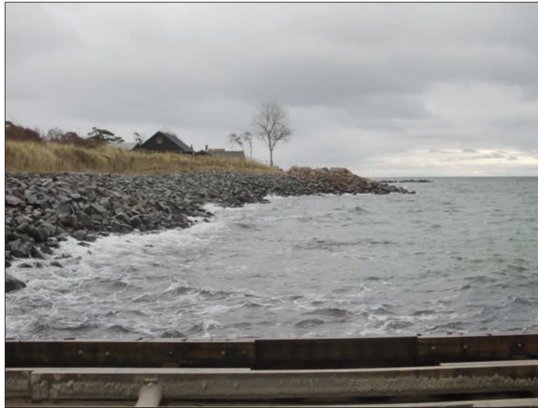
Figure 3. Examples of hard structures at the coast of Löderup (Photo: L. Bontje, November 2015).

These negative effects motivate the preferences regarding coastal protection gradually shifting from ‘hard’ solutions to ‘soft’ coastal defence techniques in most European countries (Hanson et al., 2002, Mulder et al., 2011, Hanley et al., 2014). This preference fits with the paradigm shift as explained by Stive et al. (2013): “Where in the past the challenge was formulated to ‘fight’ the forces of nature [with hard structures, red.], today’s approach recognizes many issues other than protection against flooding, especially the multiple ecological forces that have to be accommodated and can help the processes of protection.” (p.1002). The present coastal management approach of the municipality of Ystad emphasizes the natural processes of erosion and accumulation and combines the existing hard structures with new soft solutions (2008a) – fitting the new paradigm.