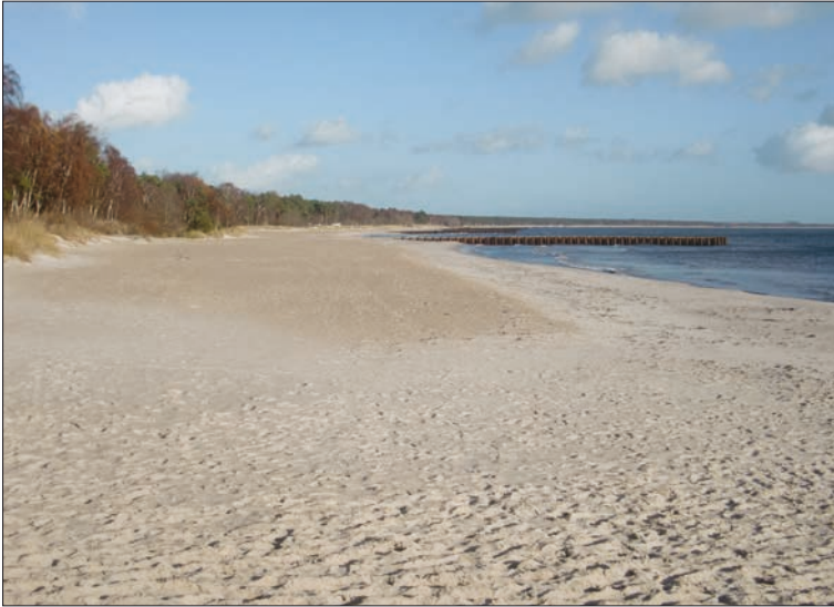
Figure 4. ( Nourished ) beach and groyne at Ystad Sandskog (Photo L. Bontje, November 2015).

ishments in 2013: the application was approved based on existing laws without even a court hearing (Land and Environmental Court, 2013).