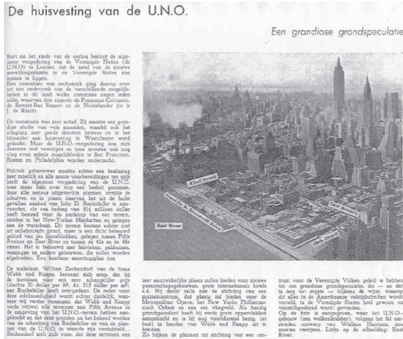
3. Part of a page of the Dutch periodical BOUW, June 1947.