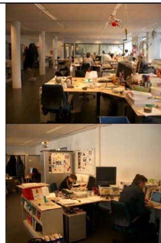
Figure 2 Floorplan StudioMingle