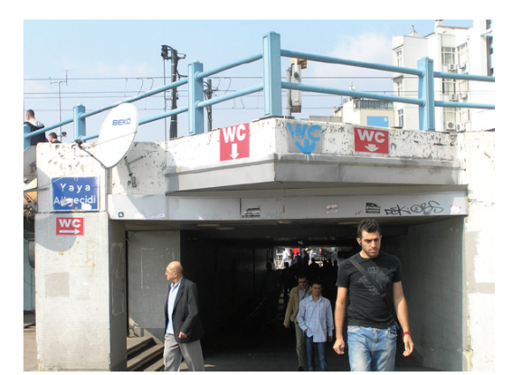
Figure 2. Photo 1 taken by a participant photographer / observer in the Karaköy area.

Appendix 5: ' Photo taken by a participant photographer / observer in the Karaköy area ' with a table showing a selection of interpretations.