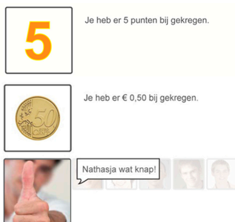
Figure 2. Examples of three types of rewards (translation from top to bottom: “You earned 5 more points”, “You earned 50 more Eurocents”, “Natasha, how smart!”).