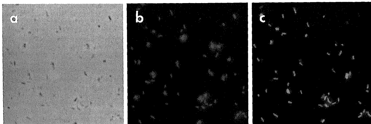
FIG. 1. Phase-contrast and fluorescence photomicrographs of an artificial mixture of three different acidophilic bacteria, T. ferrooxidans , T. concretivorus , and A. cryptum , treated by the combined immunofluorescence–DNA-fluorescence staining technique. (A) Phase-contrast micrograph of the mixture; (B) photomicrograph of the same field as shown in panel A, with UV illumination and filters for ethidium bromide. Note that all bacteria visualized by phase-contrast microscopy are stained with the ethidium bromide fluorochrome. (C) Photomicrograph of the same field shown in panel A, with UV illumination and filters for the FITC conjugate. T. ferrooxidans cells are stained green. Note that the other bacteria are stained red by the ethidium bromide staining and can be visualized simultaneously with the FITC staining at this filter combination.

immunosorbent assay (ELISA) and an indirect immunofluorescence assay (Table 1). Strong reactions were obtained with all the tested strains of T. ferrooxidans . Apart from T. ferrooxidans a number of species were tested that are supposed to belong to the normal microflora of microbial leaching systems: the autotrophic organisms T. thiooxidans and L. ferrooxidans , the facultative heterotrophs T. acidophilus and A. cryptum , and the thermophilic pyrite-oxidizing bacterium of the genus Sulfolobus . No reactions were found with any one of the bacteria other than T. ferrooxidans and one of our strains of L. ferrooxidans . We established in subsequent studies, however, that this bacterium had the same physiological properties as T. ferrooxidans (i.e., it was able to use reduced sulfur compounds) and that it obviously had been mislabeled.