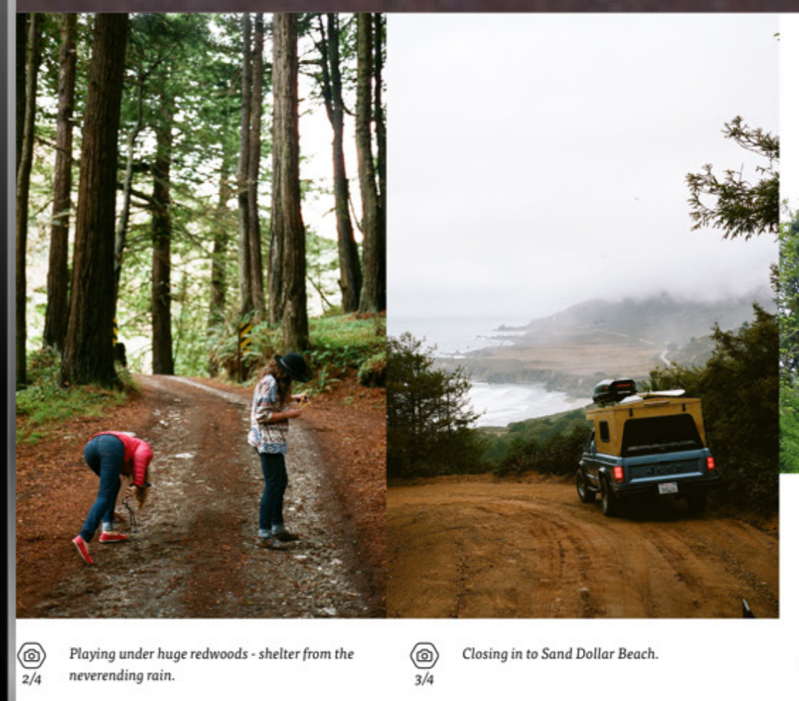
Playing under huge redwoods - shelter from the neverending rain. 2/4