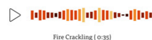
Fire Crackling (0:35)

The fire was crackling, covered by the sounds of the crashing waves.