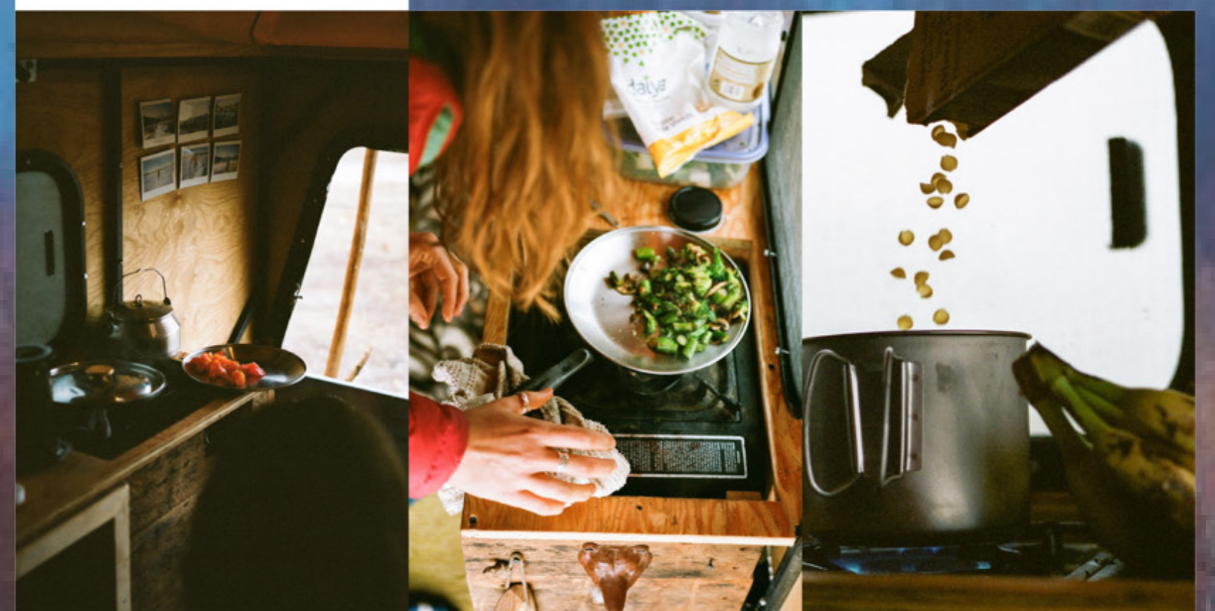
Chopping tomatoes for a proper bolognese pasta dinner. 1/3

Clouds as we circled the wagons a few hours after dark. Light tapping started on the aluminum roof of my camper late Wednesday night and by morning, the dishes from the night before were overflowing with the first rain the area had seen in months.