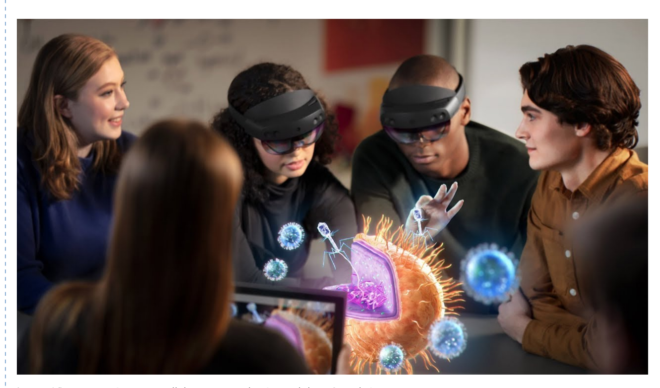
image / figure 1: Remote collaboration with 3D models in SocialVR.

introduction (continued): space for images