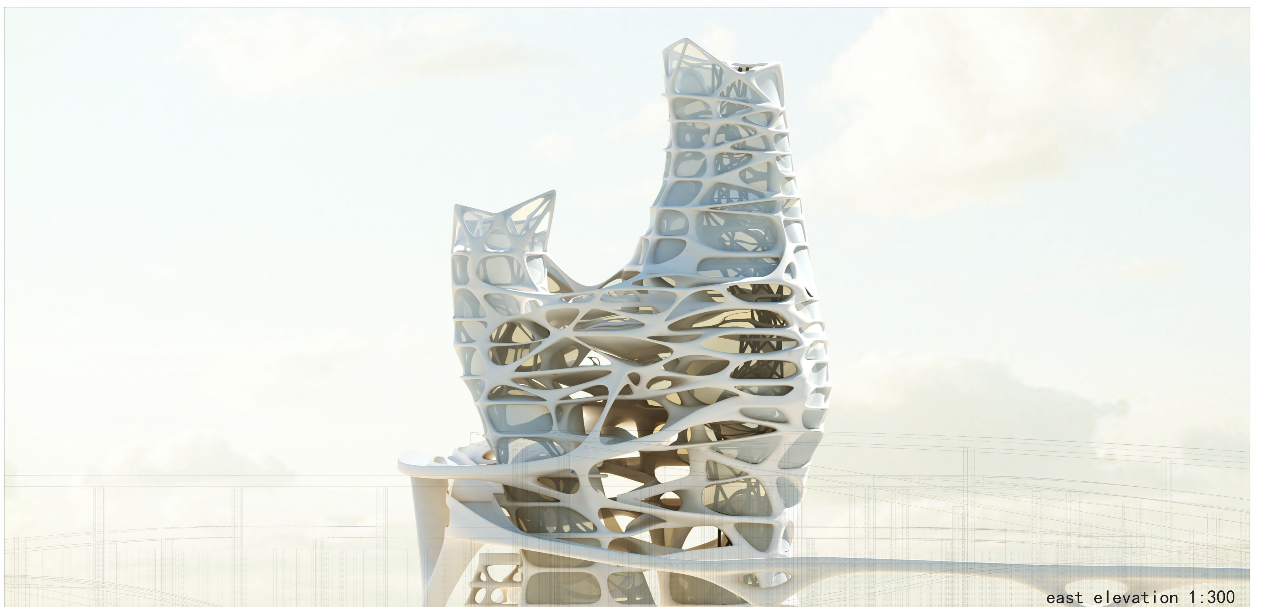
east elevation 1:300