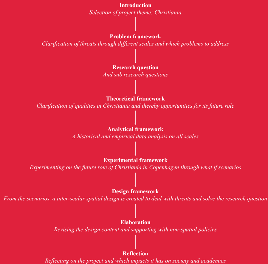
Fig. 117: The project structure with the most important elaborated chapters