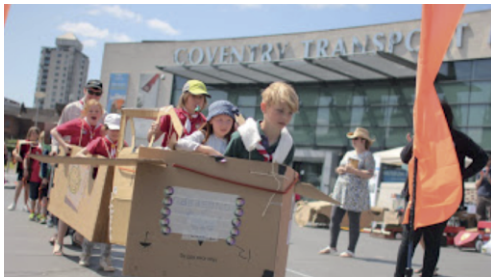
Figure 2. Wear your wheels.

The author would like to thank Coventry City Council, the City University Initiative and Fab Lab Coventry team for their collaboration.