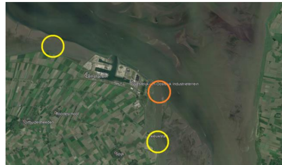
Figure 2 - Potential wave run-up and wave overtopping measurement locations (yellow circles) and potential water level, current and wave measurement locations (yellow and orange circles).

The present paper is made in preparation for this extensive measurement campaign. It aims to evaluate the most suited locations for wave and overtopping measurements, as well as to gain insight in why such large wave heights are predicted for the dike Eemshaven-Delfzijl.