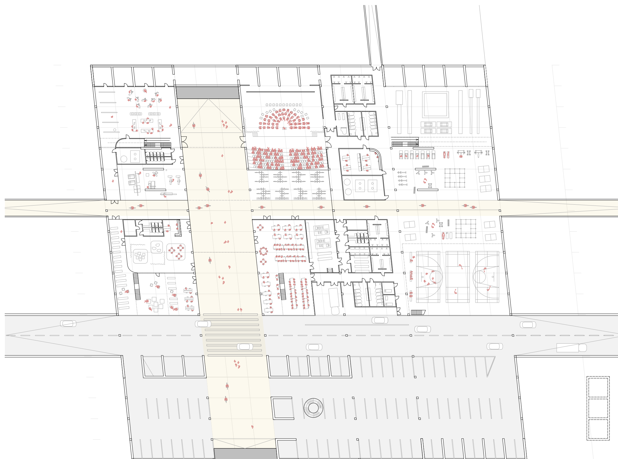
Underground floor plan (level -4m) 1:400