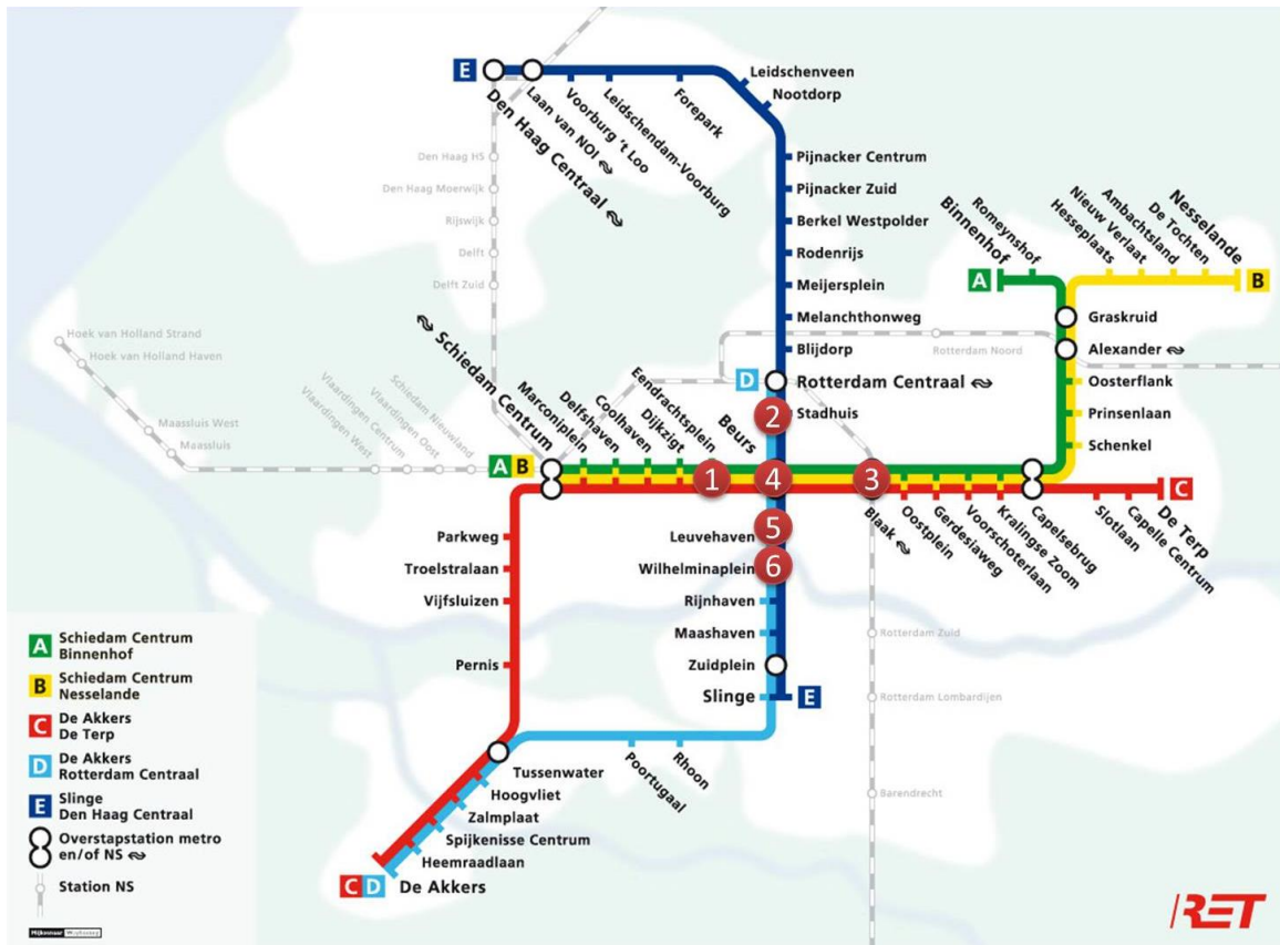
FIGURE 2 Disrupted area in metro network of Rotterdam, The Netherlands.