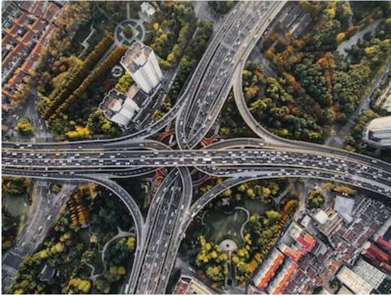
Ya'nan East Road Interchange, part of Shanghai's road network