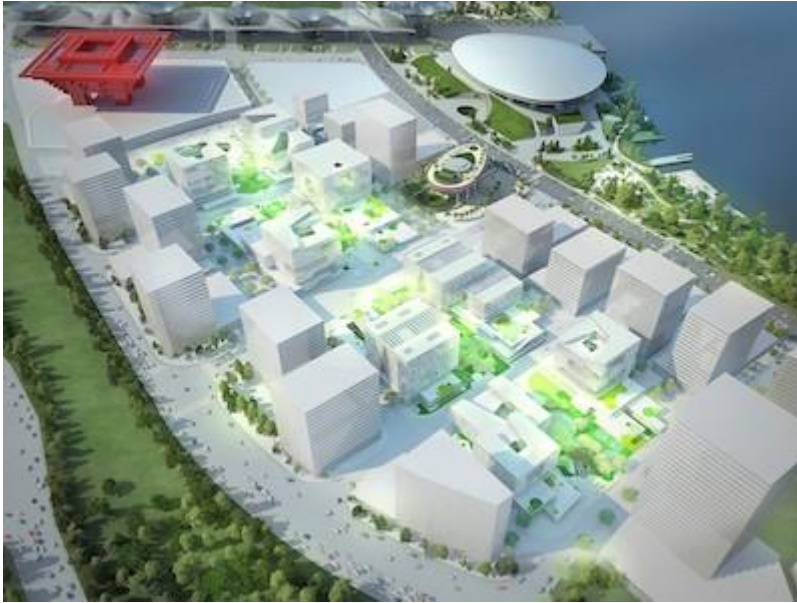
Green Valley Offices project for the legacy phase of the Expo 2010

"Expo 2010 Shanghai was the first Expo to have an Urban Best Practices Area to demonstrate tangible solutions to the world's challenges"