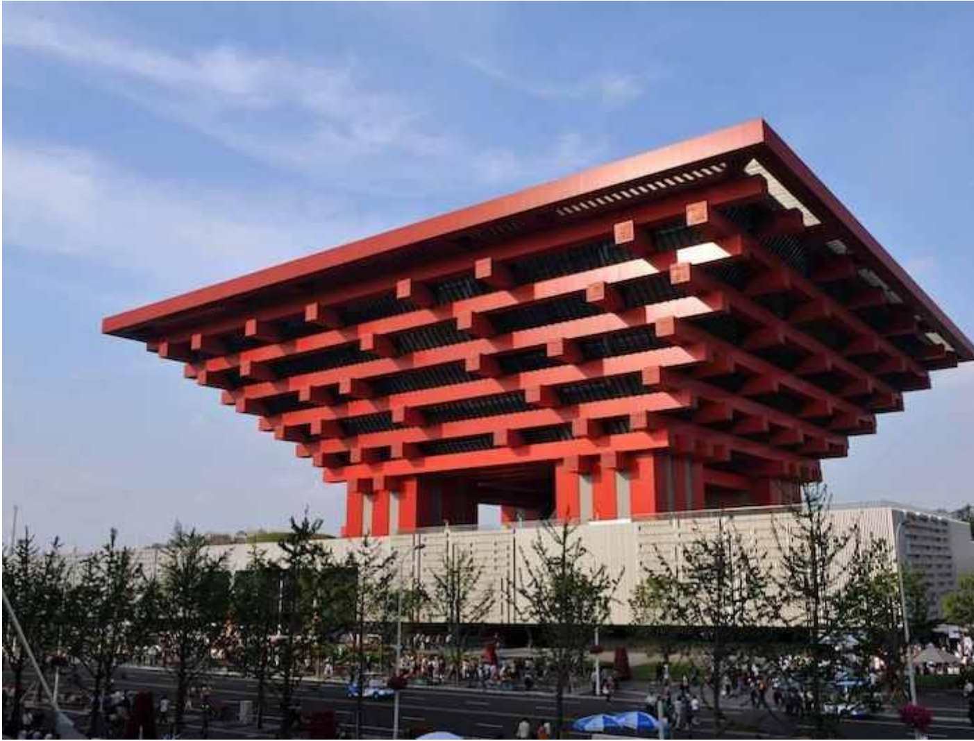
China's Pavilion at Expo 2010, now the China Art Museum

To ensure the Expo preparation activities were coordinated in an effective and efficient way, the Shanghai 2010 World Expo Executive Committee was established, consisting of representatives from both central government and 24 related committees of the Shanghai government. The Shanghai World Expo Coordination Bureau was established as a core institution in charge of the daily operation and development of the Expo area, and to help implement national policies and the policies of the Shanghai World Expo Organizing Committee until its tasks ended in 2012. Besides, the Expo Land Company was established in January 2004 to take charge of land expropriation, land development and relocation. The Shanghai Shenjiang Riverbank Development and Construction Investment (Group) Ltd was then in charge of the Huangpu Riverbank except for the Expo site, in cooperation with the Shanghai World Expo Bureau. Thus, the preparation of the Expo, from land management to construction, were assigned to responsible entities to ensure a smooth process.