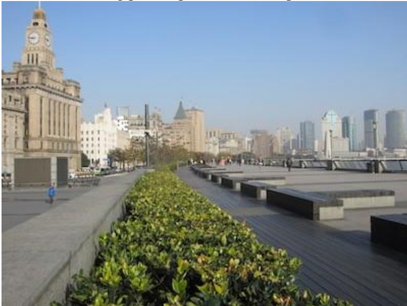
The revamped riverfront of the Bund

To invite new planning concepts and creative ideas in the preparation of the Expo site, the Shanghai Urban Planning Administrative Bureau organised a series of concept design competitions in 2000 and 2001 to redesign the 41.2km riverbank line and 91km 2 waterfront area along the Huangpu Riverbank. A Master Plan for the waterfront area of the Huangpu River was finalised based on the concepts provided by the winning team, SOM. The plan divided the Huangpu Riverbank into the central part, northern extension and southern extension. The central part covers 20km along riverbank line and an area of 22.6km 2 , including a 6.68km 2 core area to prepare the Expo. There are five objectives defined in the Master Plan regarding the transformation of the Huangpu River waterfront: