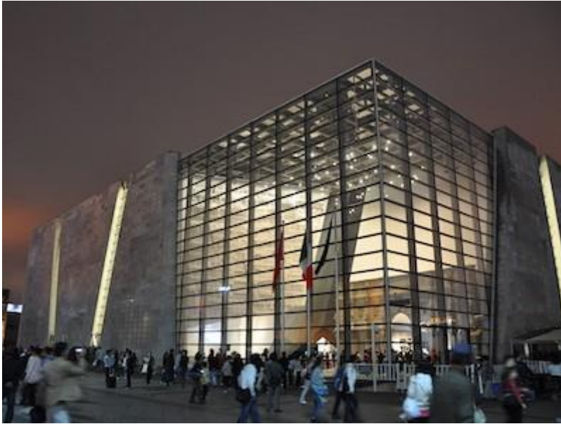
Italy's Expo 2010 Pavilion, now a cultural centre

Despite extensive preparation of the legacy plan and legacy strategy, the post-Expo development still faced several bottlenecks. The first was a lack of a more detailed guidance for implementation, which slowed down the development of key areas on the Expo site. The second was the lack of coordination on the development of the Expo site between different urban districts, leading to the risk of having very similar urban functions without nuance and local identity. The third was the hesitation of the private sector to get engaged in the development of Expo site due to the limited power of changing planning concepts. Instead, they chose to develop urban districts adjacent to the Expo site. Furthermore, District Governments competed fiercely for investment, with the result that some waterfront locations were well developed at an early stage while others fell behind due to a lack of investment. Shanghai recognised these bottlenecks and made efforts to find solution. A series of design competitions were arranged to invite innovative development concepts for the Expo site and in 2012, a public engagement process was launched to improve the development concept. The green valley concept, for example, was brought in to integrate new sustainable solutions in both the urban design and the individual buildings on the site.