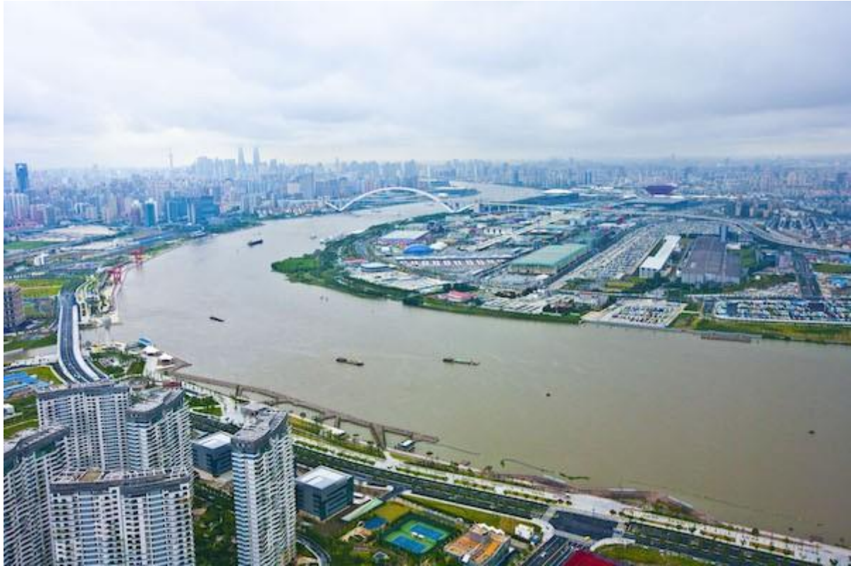
The banks of the Huangpu River during Expo 2010

"The theme, 'Better City, Better Life', depicted Shanghai's vision of its future"