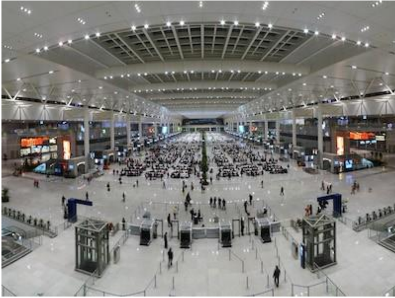
Extension of Hongqiao Airport ahead of Expo 2010