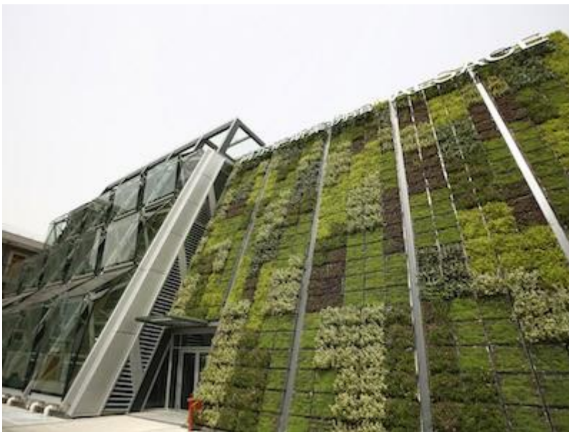
The Alsace Pavilion in the Urban Best Practices Area