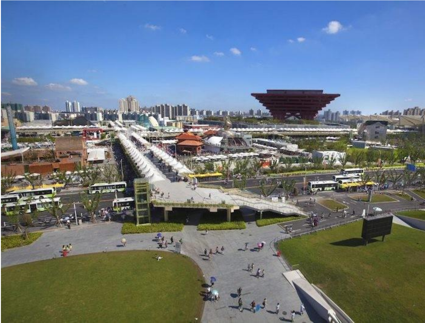
Overview of Expo 2010 Shanghai