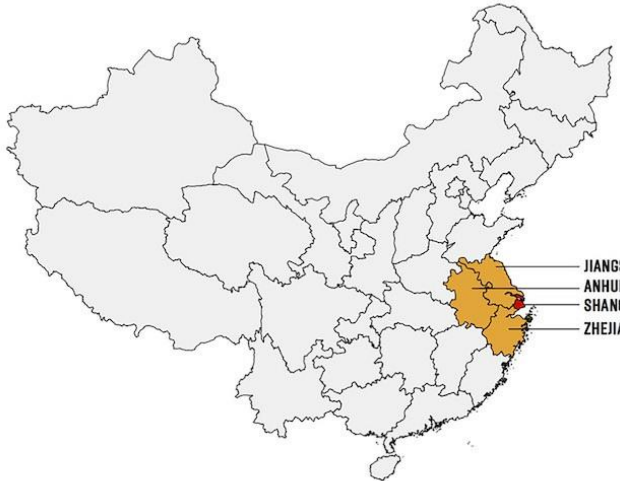
The Yangtze River Delta region within China

The discussion of concrete measures in regional collaboration regarding the World Expo started in 2003, with an agreement signed by cities in the YRD to collaborate on Expo preparations. A working group for Expo preparations was set up with joint force to host the Expo together and coordinate tourism service and facilities. Six major cities in the region including Suzhou, Hangzhou and Ningbo organised Expo forums on important issues such as liveable cities, digitalisation and urban development. Besides, a series of friendship days were organised every ten days during the Expo so each city in the region had the chance to welcome Expo visitors from different countries for exchange. For each of the involved cities, the Expo triggered urban development and beautification efforts to present the best image to the outside world. As a result, Expo 2010 Shanghai became the first Expo where all neighbouring cities in the region were active participants in the preparation of the event and played an important role within the Expo programme. Following the regional integration concept, the one-hour transport network system within YRD Shanghai was proposed. The Hangzhou High-Speed Train became the first regional infrastructure resulting from the regional collaboration. It was built in just 20 months and opened in October 2010.