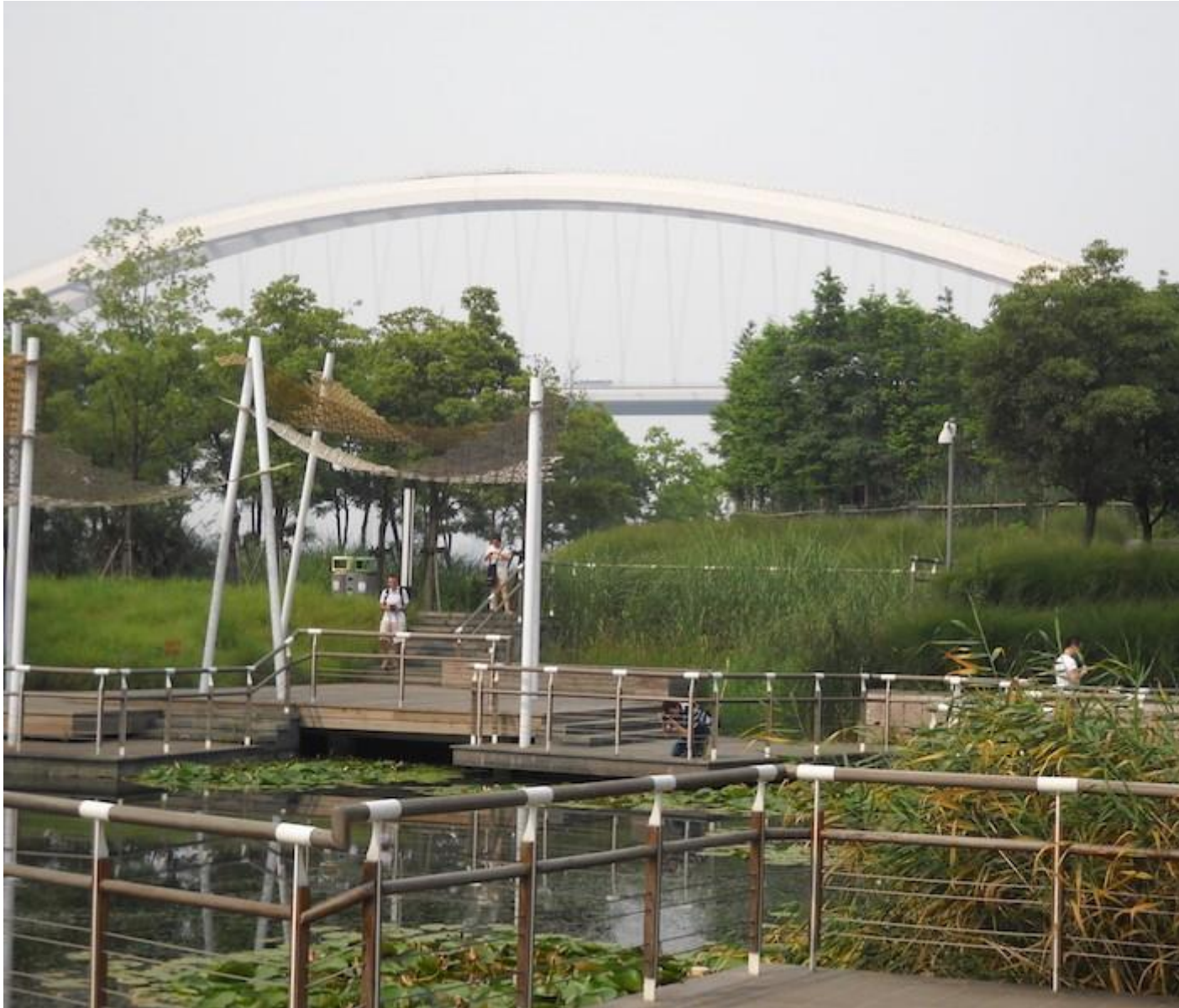
Expo Park

"Local citizens gradually got to know the Expo and felt themselves as part of the mega-event"