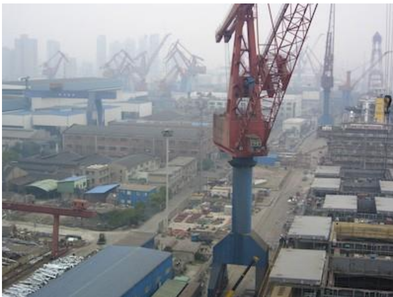
The shipyards on the banks of the Huangpu River in Shanghai, prior to Expo 2010

"Shanghai's World Expo preparations served as a catalyst to facilitate the urban restructuring process"