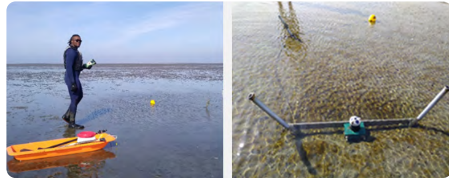
Figure 2: Recent field campaign to measure waves and currents during the yearly winter storms in the same location.

waves and the foreshore in a timely and cost-effective manner. This research applied state-of-the-art numerical modelling tools such as SWAN, SWASH, XBeach and OpenFOAM to estimate the nearshore wave heights and the volumes of waves overtopping the dike.