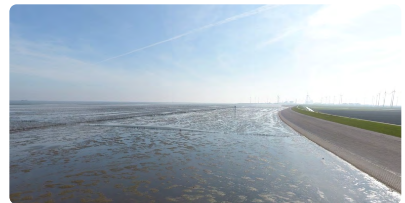
Figure 1: Dike partially covered by asphalt and partially by grass, fronted by a shallow, mildly-sloping mudflat along the Dutch Wadden Sea coast.