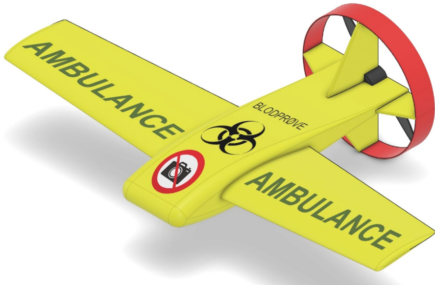
Fig. 3 The ethical framework has been tested and refined via a case study where a drone was designed for blood sample transportation within Danish public healthcare (Cawthorne and Wynsberghe 2019)

on mitigating safety and privacy risks, and on enhancing explicability. For example, consideration of safety and capability caution lead to minimizing the size and weight of the drone to under 1.5 kg while still having a useful payload capacity. A fixed-wing aircraft configuration was chosen to support cost saving to taxpayers as this type of drone is the least expensive. This configuration aided explicability, as the drone always flies forward—demonstrating by its behavior that it has a purpose and is not loitering (as a multicopter drone is capable of). Explicability enhancements were identified as being important in the context of use since the drone would fly over the public to reach major hospitals. The drone’s color, shape, and markings were chosen to mimic that of an ambulance, and a mobile app which would allow citizens to be notified of the drone’s presence was proposed.